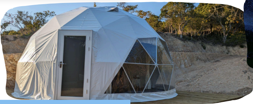
▲ DOME TENT (28m 2 ) - AIR CONDITIONING

CAPACITY: 2 - 4 PEOPLE 2-ADULT SHARING - HKD 3,540 UP/PERSON 3-ADULT SHARING - HKD 3,400 UP/PERSON CHILD WITH BED - HKD 2,490 UP | CHILD WITHOUT BED - HKD 1,050 UP