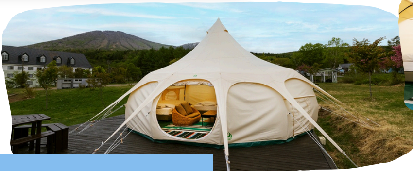
▲ LOTUS TENT (28m 2 )