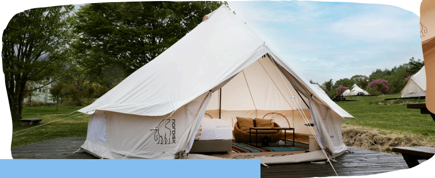
▲ NORDISK TENT (19.6m 2 )